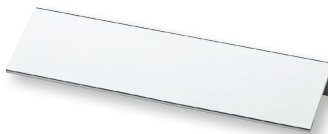
EP01-0128PC Polished Chrome Holes are 128mm center-to-center