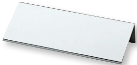
EP01-0077PC Polished Chrome Holes are 3" center-to-center