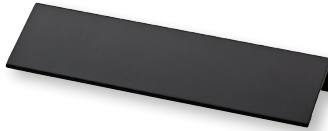
EP01-0128FB Flat Black Holes are 128mm center-to-center