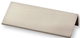
EP01-0077SN Satin Nickel Holes are 3" center-to-center