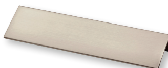
EP01-0128SN Satin Nickel Holes are 128mm center-to-center