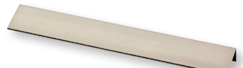
EP01-0256SN Satin Nickel Holes are 256mm center-to-center