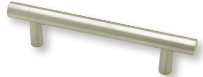
BP06-0096SS Stainless Holes are 96mm center-to-center