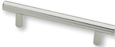
BP06-0096PC Polished Chrome Holes are 96mm center-to-center