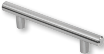
BP02-0096SN Satin Nickel Holes are 96mm center-to-center