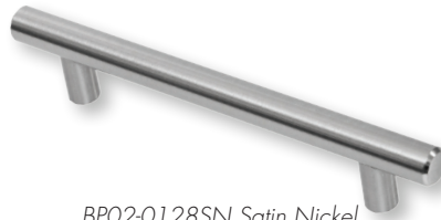
BP02-0128SN Satin Nickel Holes are 128mm center-to-center