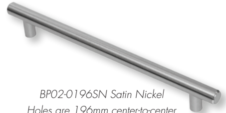
BP02-0196SN Satin Nickel Holes are 196mm center-to-center