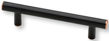
BP06-0096BCH Bronze Copper Highlights Holes are 96mm center-to-center