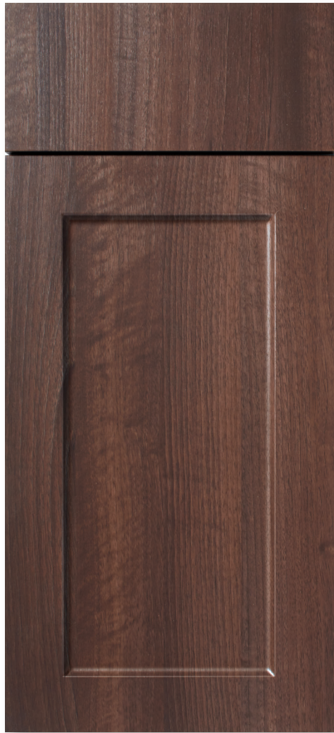
shown in Chocolate Pecan