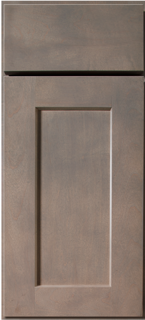
shown in Oyster