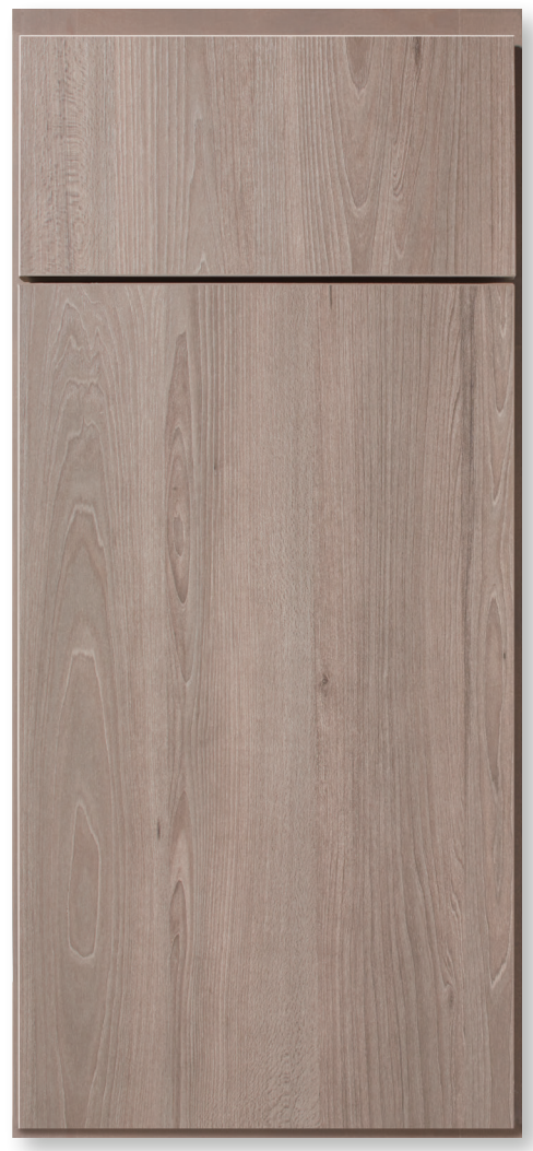
shown in Grey Cashmere