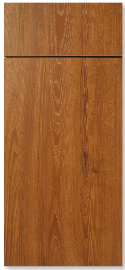
shown in Spice