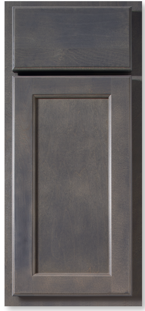
shown in Ash