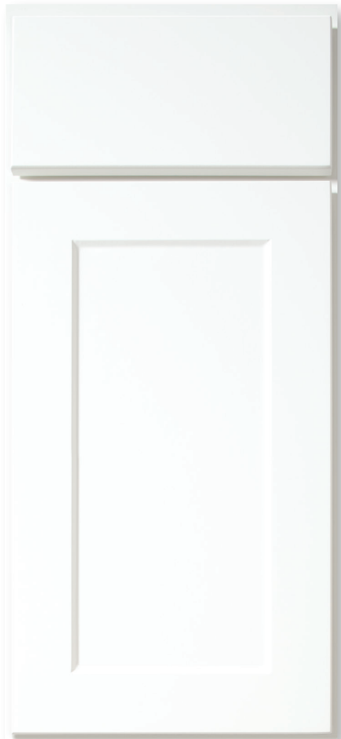
shown in Smooth White