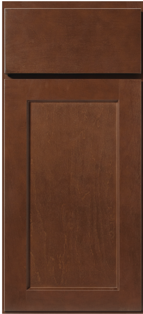
shown in Pecan