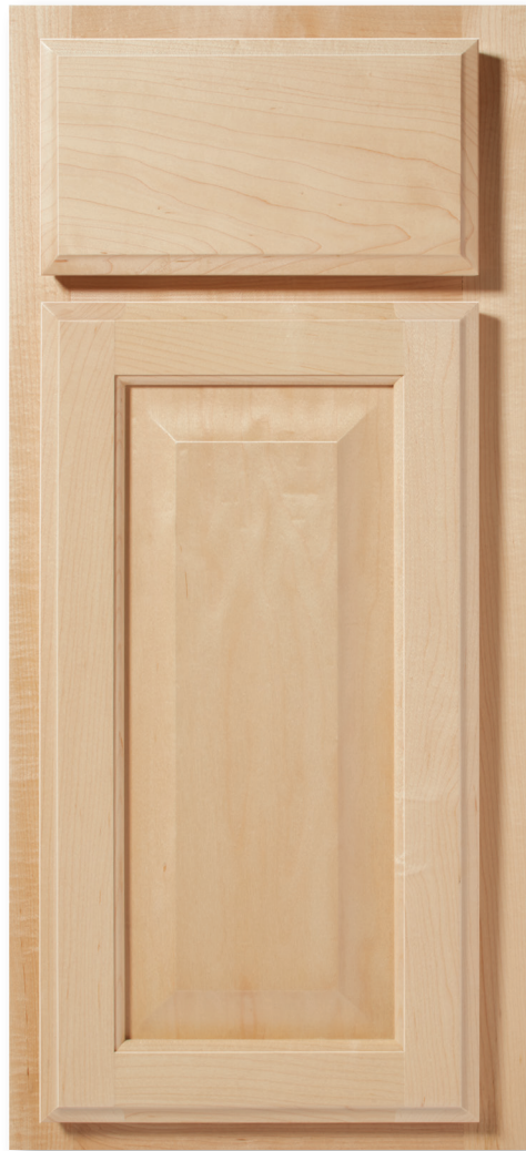
shown in Natural