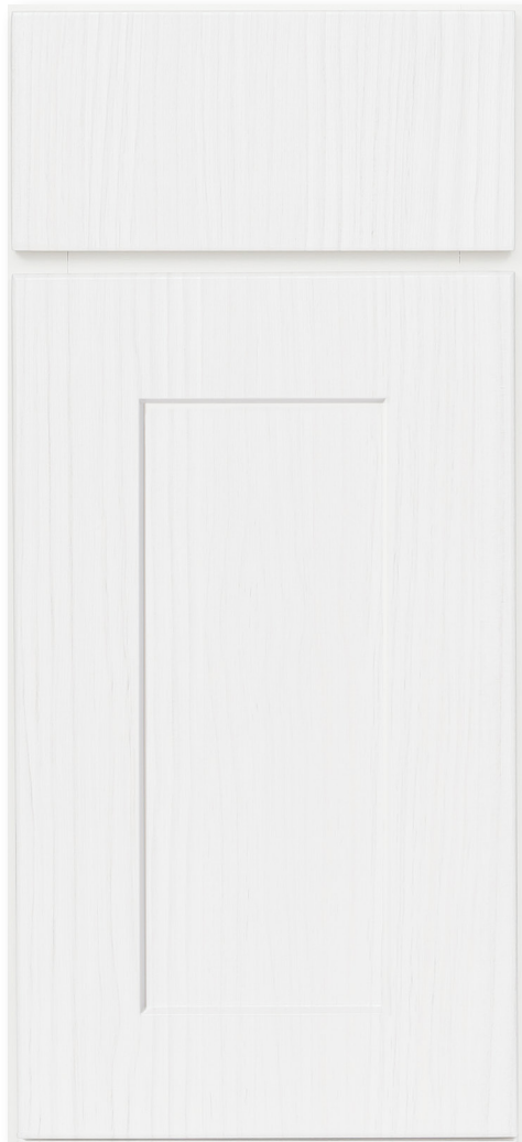
shown in Wood Grain White