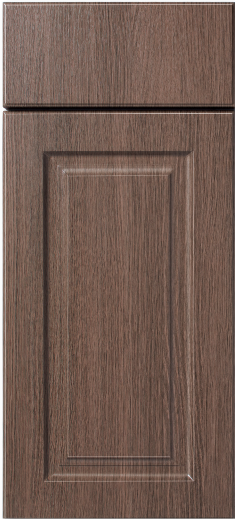
shown in Ambassador Oak