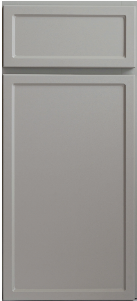
shown in Coastal Grey