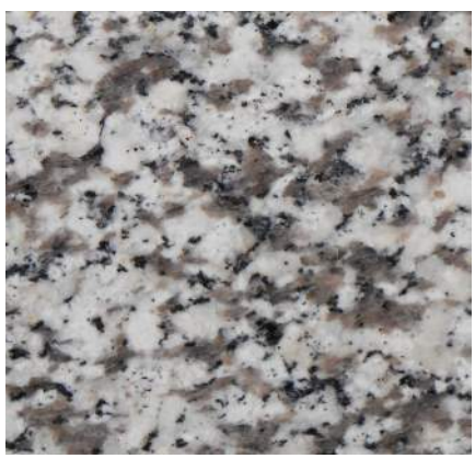
Ivory White Max 110