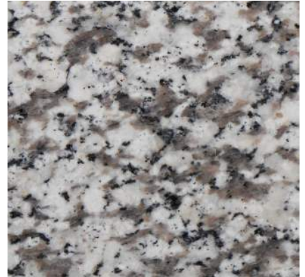
Ivory White Max 110"