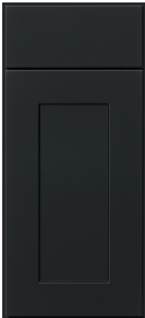
shown in Charcoal LUX