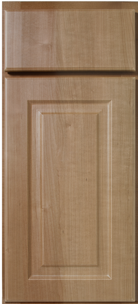
shown in Driftwood