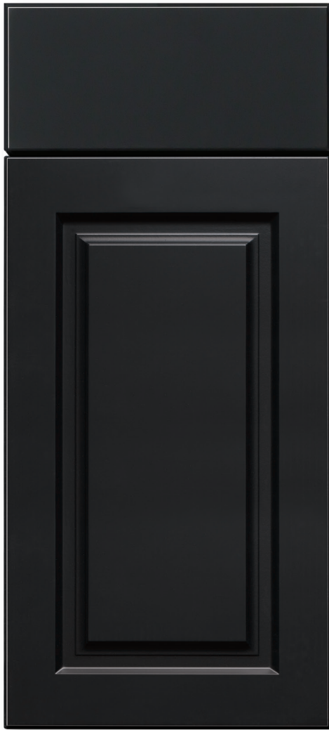
shown in Charcoal LUX